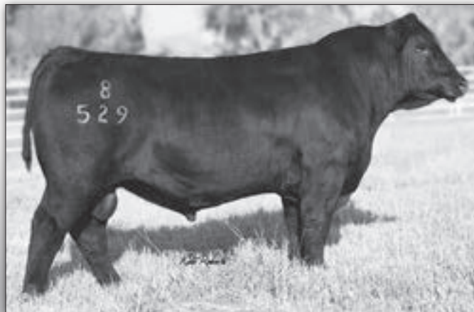
Connealy Big Valley ~ Sire of Lots 16-24

• Recommended for heifers • Consistent calving ease & easy keeping cow family