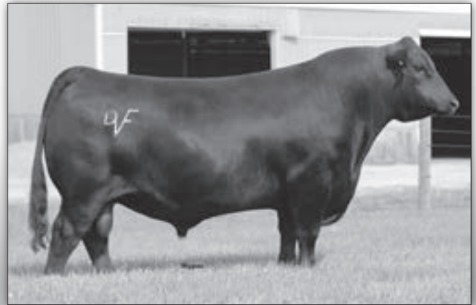
Deer Valley Wall Street ~ Sire of Lots 44-53