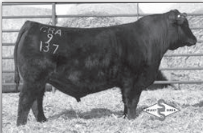
Crawford Guarantee 9137 ~ Sire to Lots 6-15

Recommended for cows Big framed, proven, powerful cow family