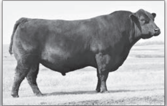
S Thrive JAS 5515 ~ Sire of Lots 29-31