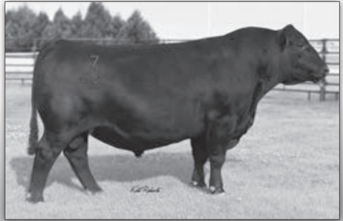
Connealy Lone Star ~ Sire of Lots 32-38

If you are looking to add longevity to your cow herd look no further. This bull's 14-year-old dam has the soundness and production to keep producing top bulls.