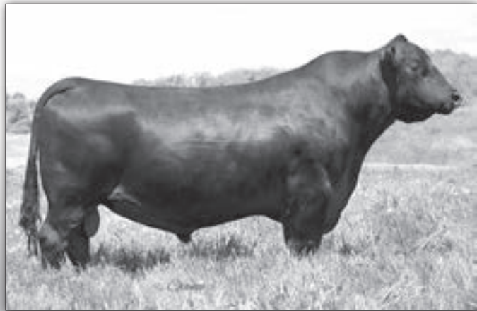
Jindra Acclaim - Grandsire of Lots 59-61