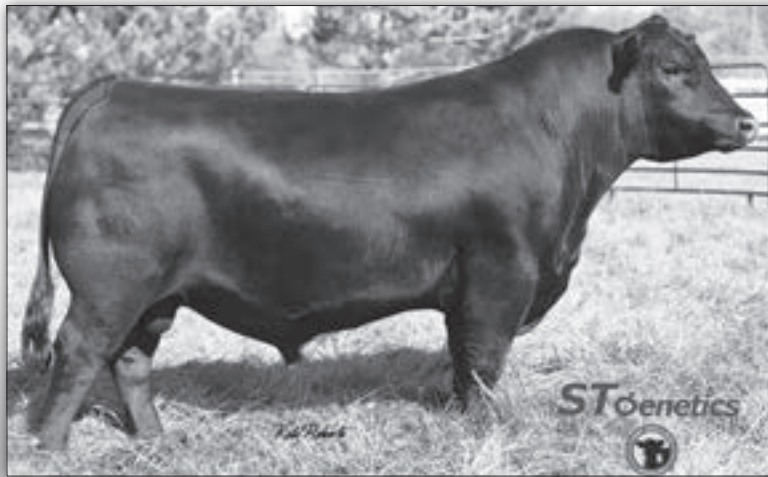
Myers Fair-N-Square M39 ~ Sire to Lots 1-5

Recommended for large framed heifers or cows Top 1% $W, Top 2% WW EPD and YWEPD Lots of length, out of a moderate framed, easy keeping dam