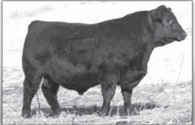
FA Full Measure 0853 ~ Sire of Lots 54-56