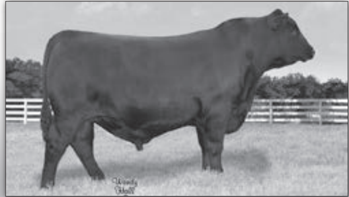
V A R Fire Power ~ Sire of Lots 25-28